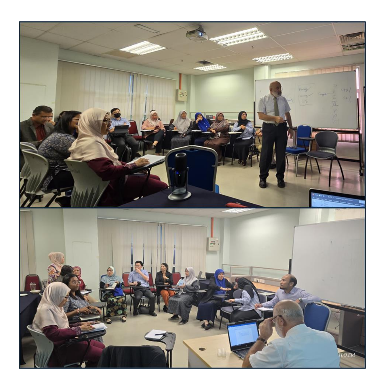
Figure 2: A Post-congress workshop on Medical writing was run at KPG Healthcare University on 7<sup>th</sup> August 2024.